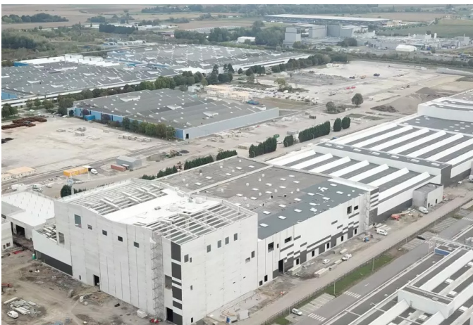
Site of the future gigafactory in Douvrin (France)