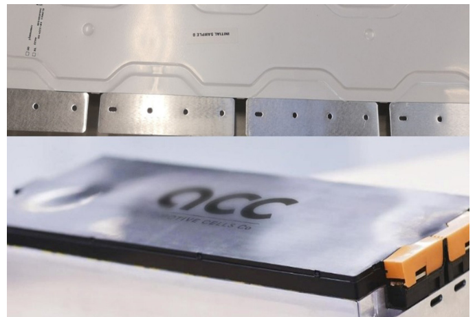
Smart busbar for ACC modules