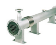
Tantalum shell and tubes