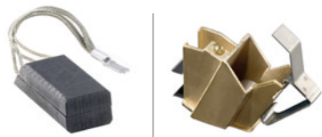
Carbon brushes & brush-holders for hot rolling mills