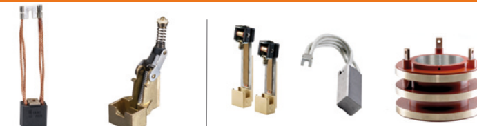
Carbon brushes & brush-holders for DC machines