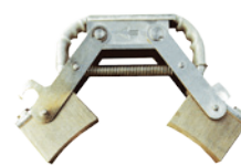
Power transmission systems with carbon brushes & brush-holders