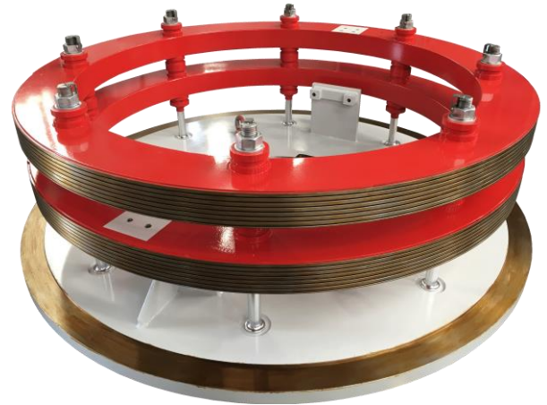
1,600 mm diameter steel slip ring

It is therefore essential to design them while considering both the electrical and mechanical requirements, as well as operating environment parameters, while also keeping in mind the customer's final needs.