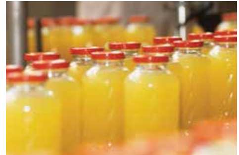
Food & Bottling