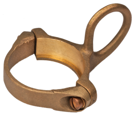
EK-3D and DD 9A61AWW612